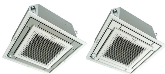
FXZQ-A (silver and Matt Crystal white panel)

Unique in the market, the fully flat cassette is a remarkable blend of iconic design and engineering excellence, with an elegant matt crystal white or a silver and matt crystal white finish. Fitting flush within the ceiling modules and fully flat with the ceiling itself, the cassette is both stylish and unobtrusive.