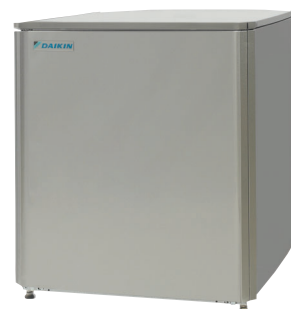
HXHD-A8 (High temperature hydrobox)