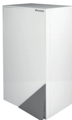
HXY-A8 (Low temperature hydrobox)