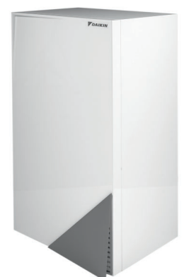
HXY-A8 (Low temperature hydrobox)